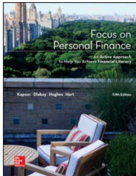
Cover picture on the 5 th edition